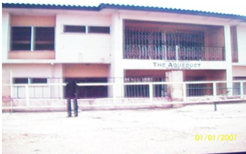
The Aqueduct Resource Centre (Aqueduct of Adelola Adeloye), 17 University Crescent, Old Bodija, Ibadan, Nigeria