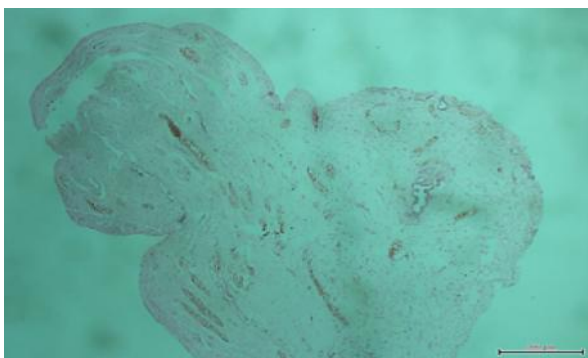
Figure 3: Polypoid tissue partly lined by pseudostratified columnar epithelium

satisfactory wound healing. Microscopy of excised surgical specimen revealed sections of polypoid tissue partly lined by pseudostratified columnar epithelium (Figure 3). There were ducts lined by similar pseudostratified epithelium and were within the underlying loose fibromyxoid stroma. Also seen were congested blood vessels. Features are in keeping with an epididymal appendage (Figure 4).