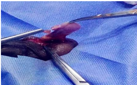
Figure 2: Showing the ligated detorsed testicular appendage just before excision

was detorsed, ligated at its base and excised (Figure 2). Scrotal incision was closed with subcuticular vicryl 2/0 stitches, and patient was discharged on 2nd post-operative day. He was seen at surgical outpatient clinic at 2nd post-operative week with no complaints and