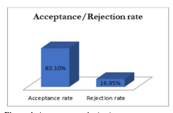
Figure 1: Acceptance and rejection rate

Oyo State recorded the maximum number of publications in terms of geographical distribution with