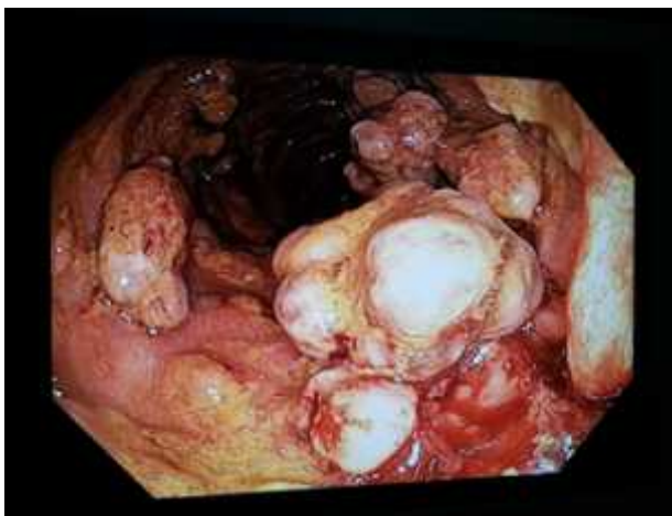
Figure 2: Polypoid masses in the rectosigmoid colon

HIV 1&2 – Negative. Colonoscopy – Multiple entangled pedunculated polypoid masses were seen in the rectum and sigmoid colon from which biopsies were taken (Figures 1&2)