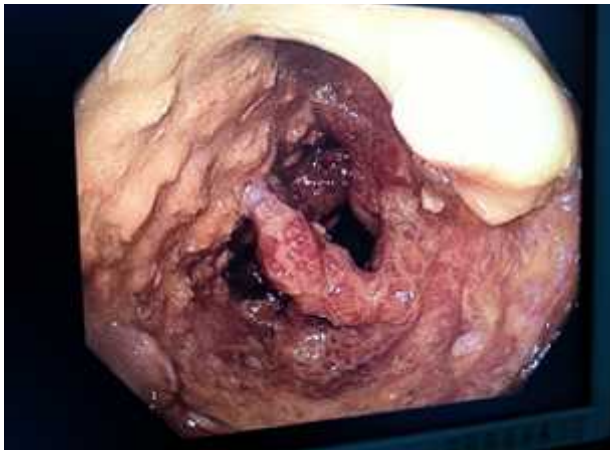
Figure 1: Polypoid masses in the rectosigmoid colon

Electrolytes, Urea and Creatinine: Na + – 135 mmol/l, K + – 3.9 mmol/l, Cl - – 107 mmol/l, HCO 3 - – 20 mmol/l, Urea – 26 mg/dl, Cr – 1.2 mg/dl. Full Blood Count: Packed Cell Volume - 34%, WBC - 6800/mm 3 (Neutrophil-48%, Eosinophil- 1%, Basophil- 1%, Lymphocyte- 43%, Monocyte- 7%), Platelets - 319,000/mm 3 . ESR - 50 mm in the 1 st hour (Westergren)